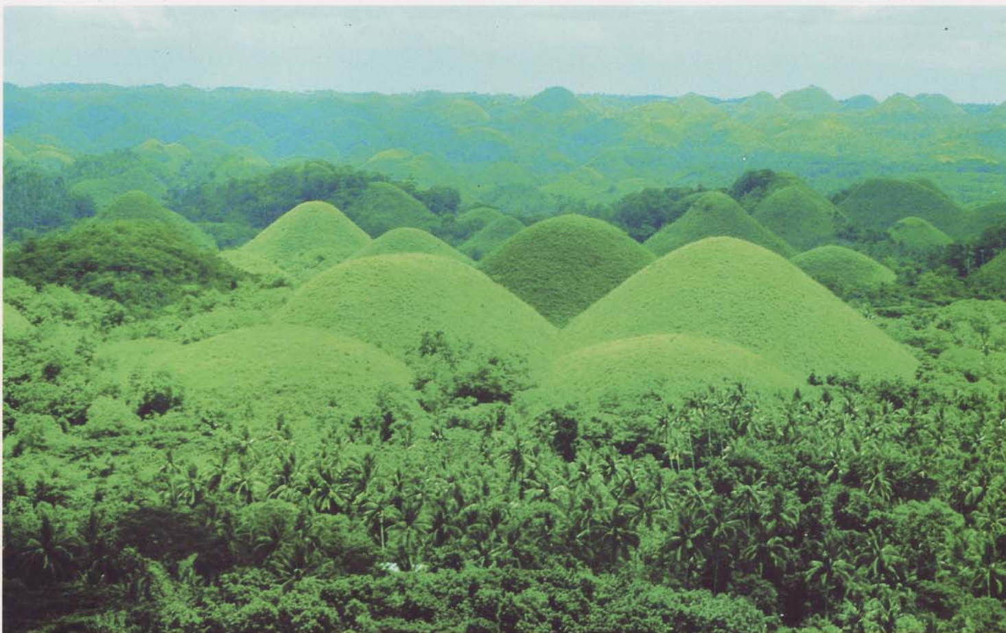
The Chocolate Hills

is still used today to cultivate rice – the staple food of the country. In my three days I managed to see much of the region, sometimes travelling by car and sometimes taking easy walks along the mud-walled terraces themselves.