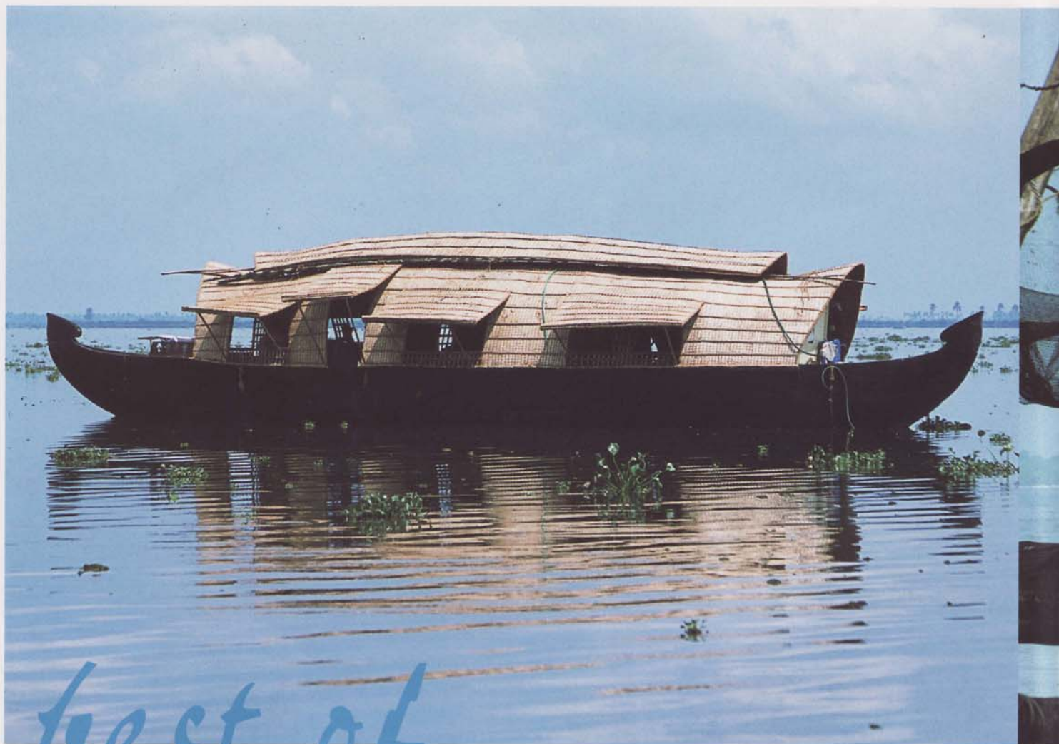
Traditional rice barge