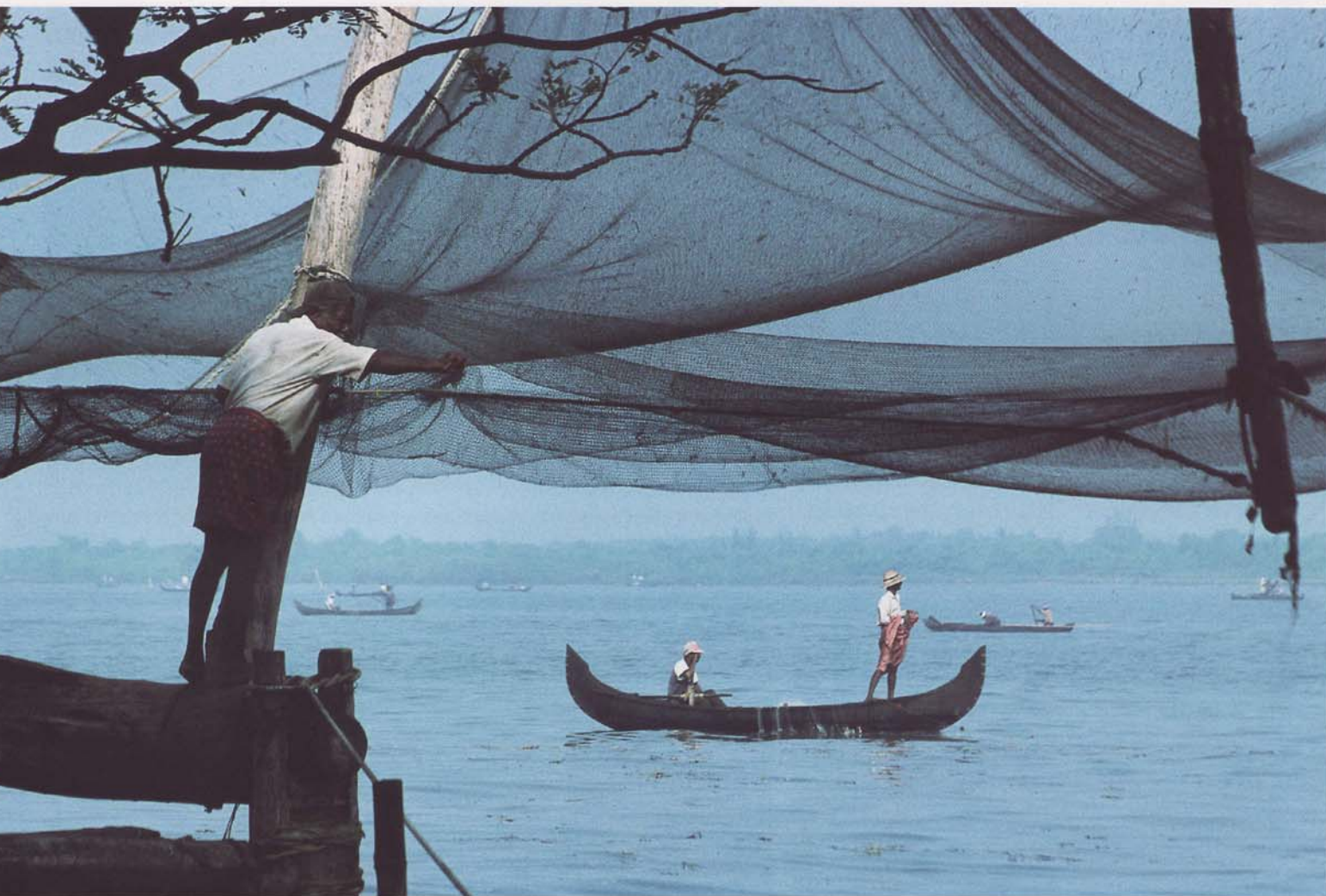
Fishermen at Cochin