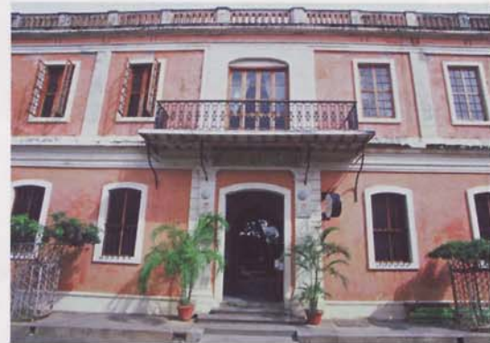
Hotel D'Orient, Pondicherry

In contrast to the coastal areas of Kerala are the hill stations and plantations of the hilly eastern and central regions. Pretty Periyar, southeast of Cochin, with its rolling green hills is a perfect place to see and learn about a multitude of different spices, including cardamom, cinnamon and black pepper. A morning spice walk can also easily be combined with an afternoon boat ride on Lake Periyar to view wildlife.