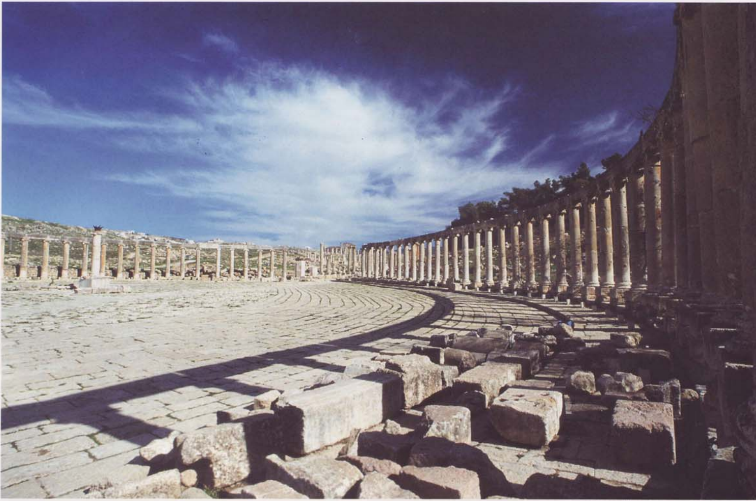
The Oval Plaza, Jerash

and fauna and showcase some of the spectacular landscapes and traditional Bedouin life. I knew that Jordan had amazing scenery – the vast expanse of Wadi Rum should be part of any visit to the country – but I was surprised to hear about the wildlife conservation. I've been lucky enough to see the Arabian Oryx in the wild in the United Arab Emirates – but if it had not been for the efforts of the RSCN, and their rebreeding project at Shaumari, these graceful animals with their long, striking horns and beautiful white coats would probably have been extinct.