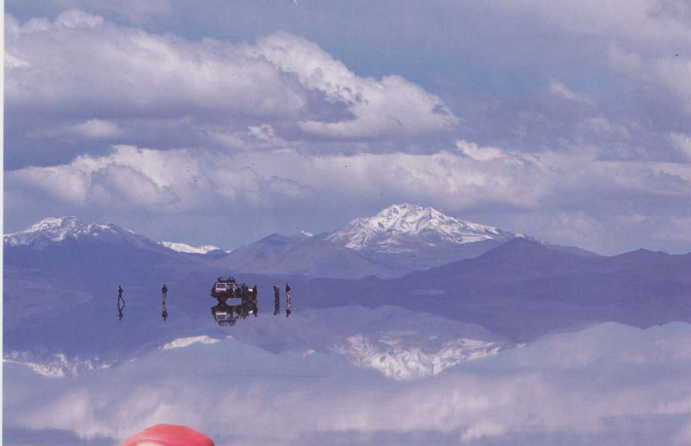
Bolivian salt flats