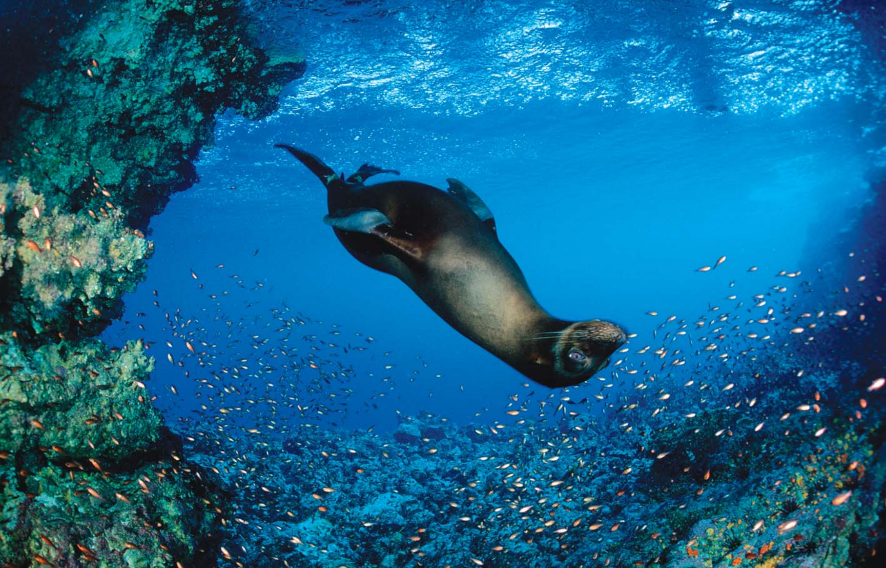
▲ Diving sea lion