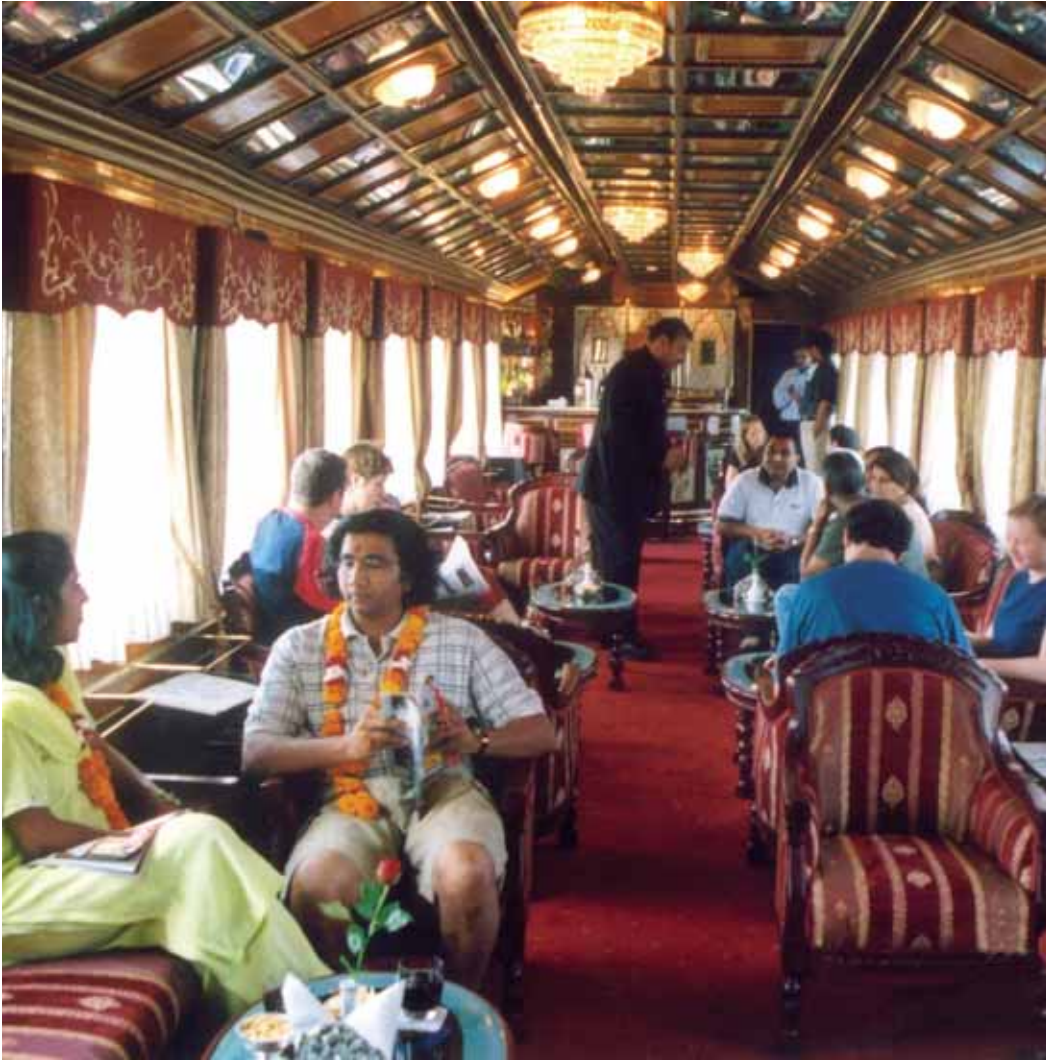
Aboard the Palace on Wheels

However, the Palace on Wheels is more than a mobile luxury hotel and restaurant, it also allows a lucky few to visit some of the finest sites in northern India. Over eight days the journey includes the cultural highlights of Delhi, the fabulous palaces in the 'pink city' of Jaipur, the mighty Mehrangarh Fort overlooking the 'blue city' of Jodhpur and the vast sandstone fortifications of Jaisalmer that seem to rise out of the desert itself. For wildlife lovers the tranquil bird sanctuary near Bharatpur provides a relaxing interlude, while searching for the Bengal tiger in Ranthambhore National Park is an unforgettable experience. The serene Lake Palace at Udaipur and the stunning marble Taj Mahal glowing pink in the Indian sunset are also included for romantics at heart. Whether relaxing in the sumptuous comfort of your air-conditioned compartment, the genial grandness of the well stocked bar, or the wood-panelled restaurant cars, there are few journeys or trains that compare to the Palace on Wheels.