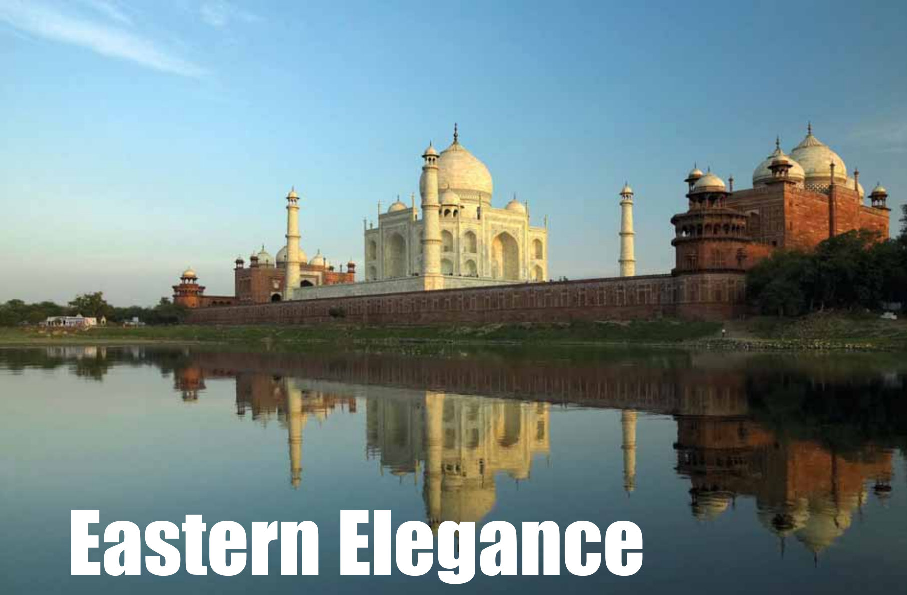
Taj Mahal, Agra