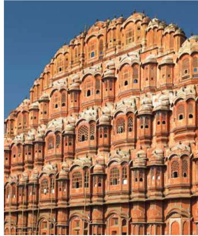
Palace of the Winds, Jaipur