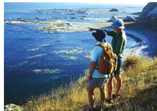
Whale watching at Kaikoura bay