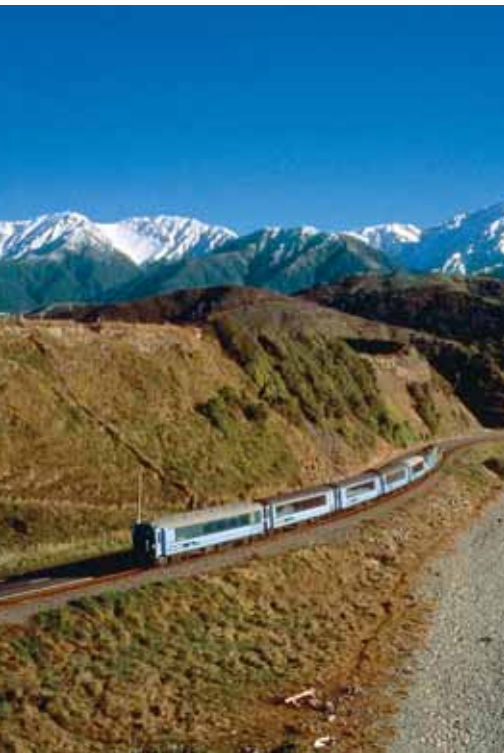
TranzCoastal from Picton to Christchurch