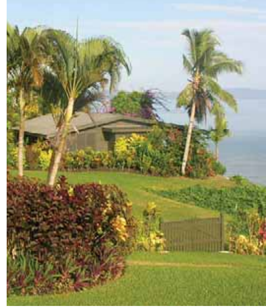
Luxury oceanfront bure, Taveuni Island Resort