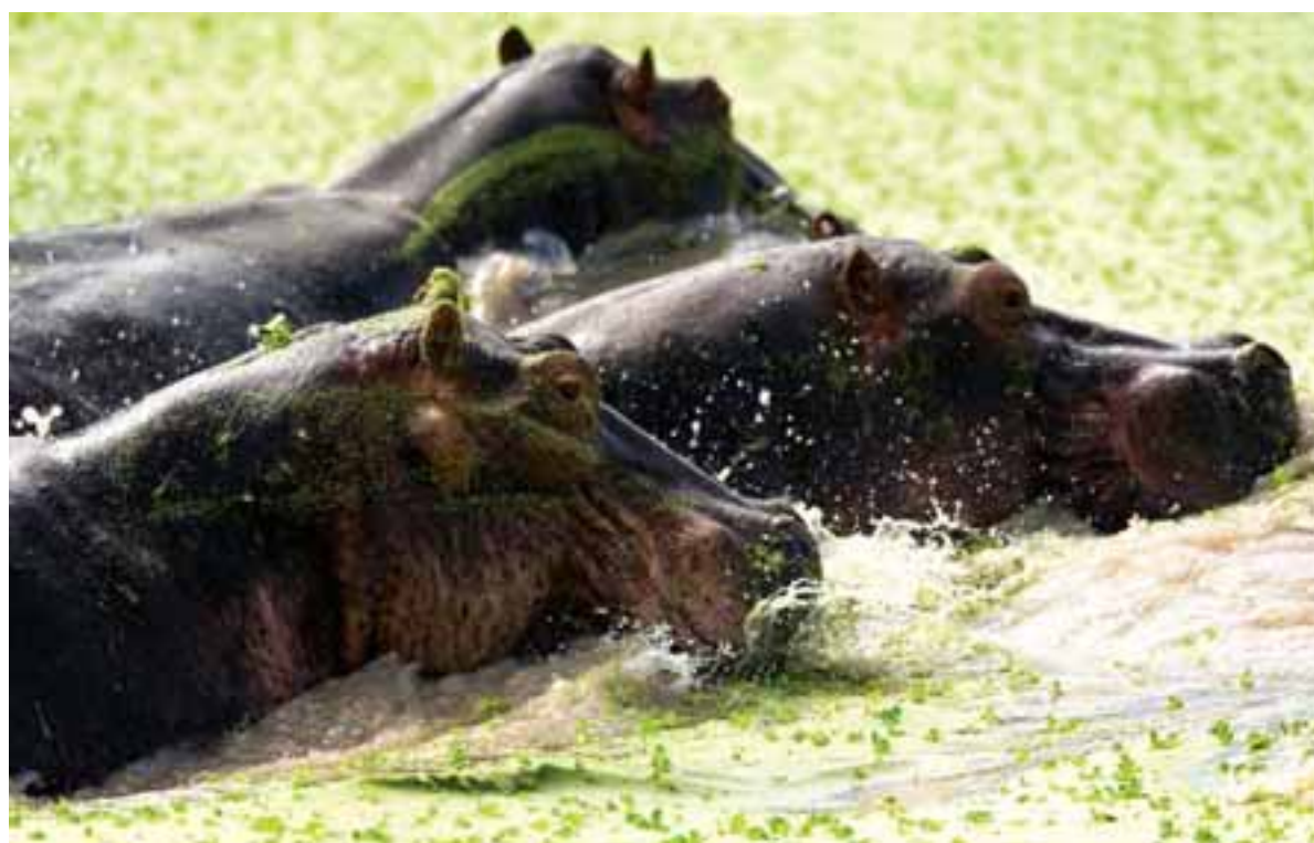
Hippo pod, ox-bow lagoon, South Luangwa