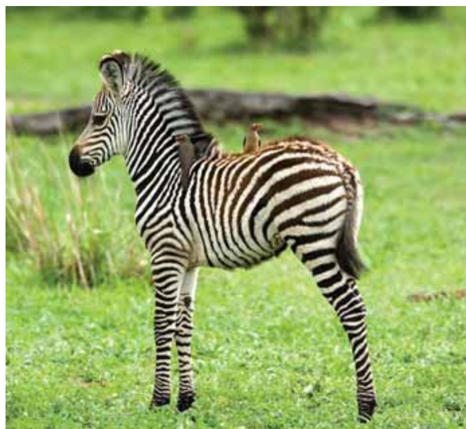
Zebra foal, South Luangwa