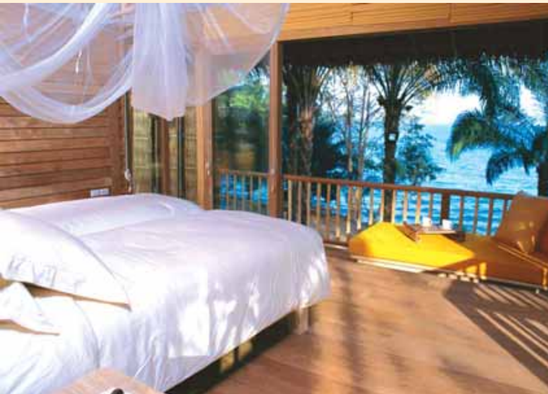
Pool villa suite, Evason Hideaway – Koh Yao Noi