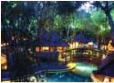
Pangkor Laut, Marina Bay