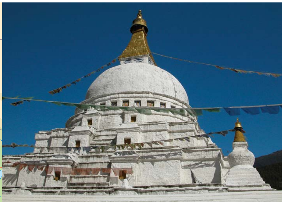
Chorten Kora, Trashi Yangtse

Most visitors to Bhutan visit the west of the country, focusing on Paro, Thimpu and Punakha, and if time allows perhaps venturing across to the central Bumthang Valley. In January I visited eastern Bhutan, an even more remote region where accommodation is basic and in limited supply, to see what it was like. Be reassured: the intrepid traveller will be thoroughly rewarded with a truly unique experience.