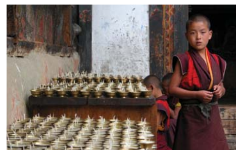
Boy monk next to butterlamps, Jakar