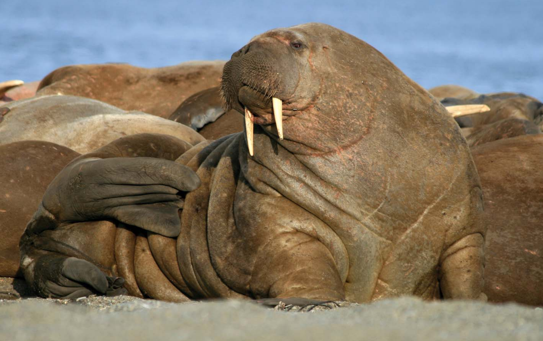
Adult male walrus

Age and whose language has infiltrated ours with everyday words such as kayak, parka and anorak. His on-board experience included talks covering all aspects of Inuit life, history and belief systems as well as a wonderful demonstration of Inuit sports and throat singing, providing an unparalleled insight into the people of this northern land. Peter's on-shore experiences included the rugged vistas of Baffin Island's towering sea cliffs, jagged mountain peaks, ice-fields and glaciers. Underfoot, lay delicate wildflowers and heathers spread out in a sporadically colourful carpet and valley floors swathed in vibrant green as mosses and marsh enjoyed their brief season of abundance.