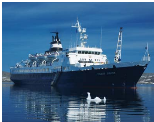
M/V Lyubov Orlova