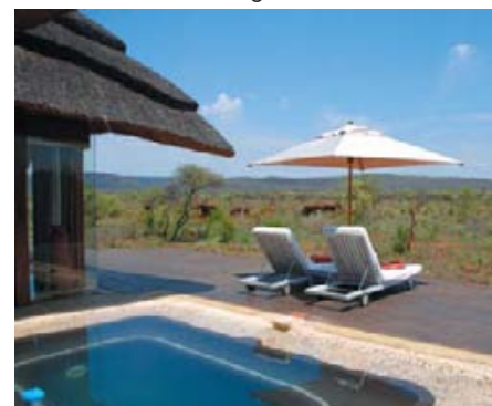
Madikwe Hills Safari Lodge