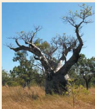
Boab tree, Bullo