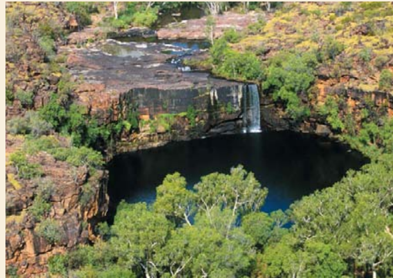
Above and below: Bullo River Station