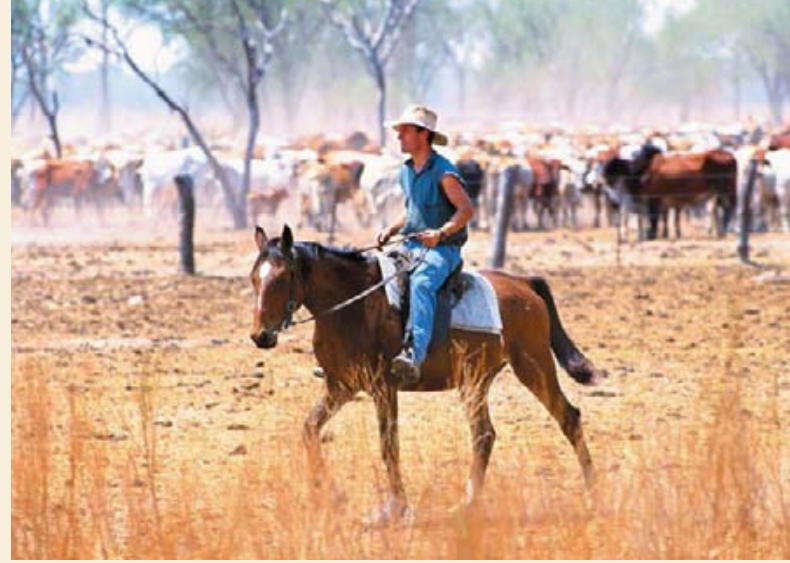
Above: Jackeroo, Bullo River Station