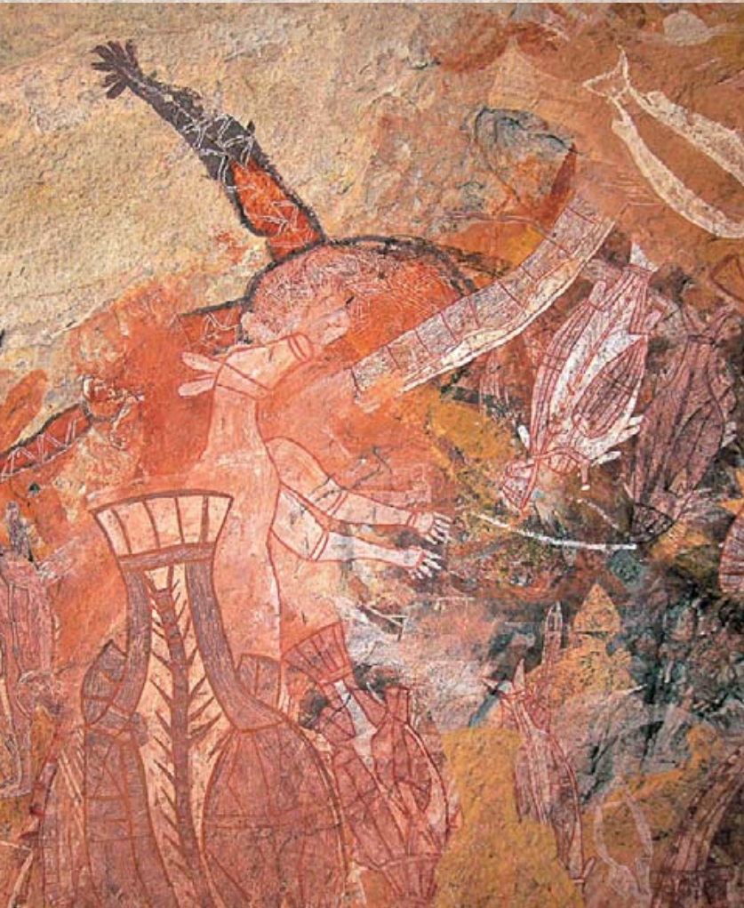
Rock art at Injalak Hill, Arnhemland