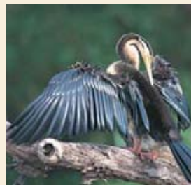
Egret, Kakadu National Park