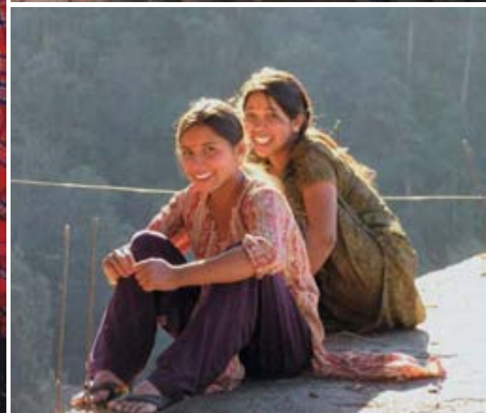
Village girls near Almora, India