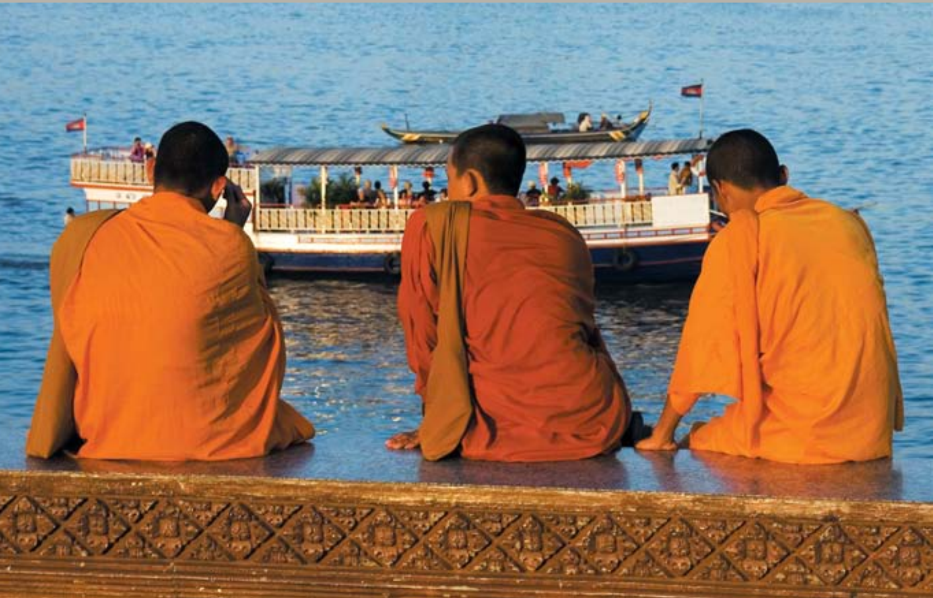
River front, Phnom Penh, Cambodia

R esponsible travel is not only about minimising the environmental impact of travel, but also about improving the social and economic infrastructures of host destinations. Ultimately, we strive to ensure that a visit from Audley clients leaves a destination better rather than worse off. The nature of our ground operations lends itself to the ethos of responsible travel – we use, wherever possible, locally owned accommodation options, locally managed grounds agents and local guides and drivers. One of the vital parts of our country specialists' research trips is to unearth new initiatives. Here are a few of our favourites.