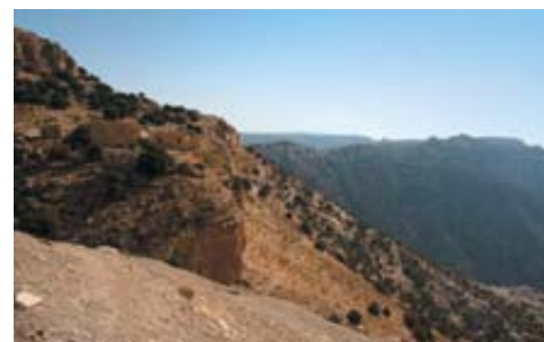
Dana village, Dana Nature Reserve, Jordan

We were delighted to top our category in the recent Daily Telegraph survey: How green is your travel company? Our responsible travel practices are also fully audited by the Association of Independent Tour Operators (AITO) and we have been awarded the maximum three stars.