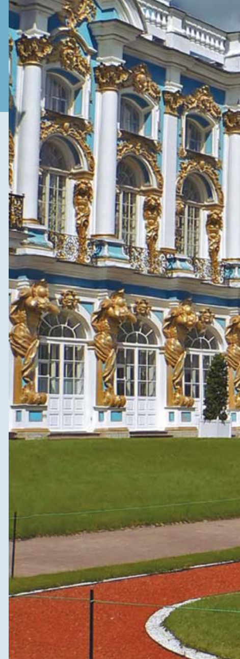
Catherine Palace, Tsarskoe Selo, St Petersburg