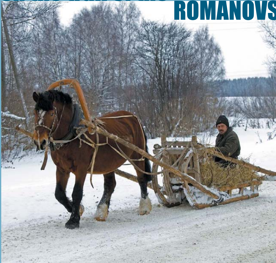
Traditional 'Sani' sledge