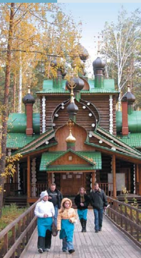
Pilgrims at Ganina Yama, Ekaterinburg