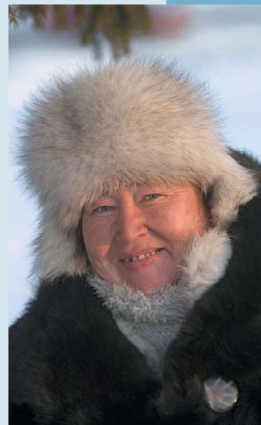
Siberian woman, Ekaterinburg

A cluster of sparkling onion domes set behind high turreted walls on the banks of the Moscow River, the Novodevichy Convent is one of my favourite buildings in Moscow, its fairytale exterior hiding a gruesome but fascinating history. Founded in 1524, the convent became a prison for a succession of meddling royal wives and princesses who were confined within its walls, often for life. Surviving the Soviet prohibition of religion as the place in which many of the Communist party's most famous leaders were finally laid to rest, most notably Khrushchev, the convent today acts as a welcome place of quiet reflection for many Muscovites seeking refuge from the city's hustle and bustle. ▶