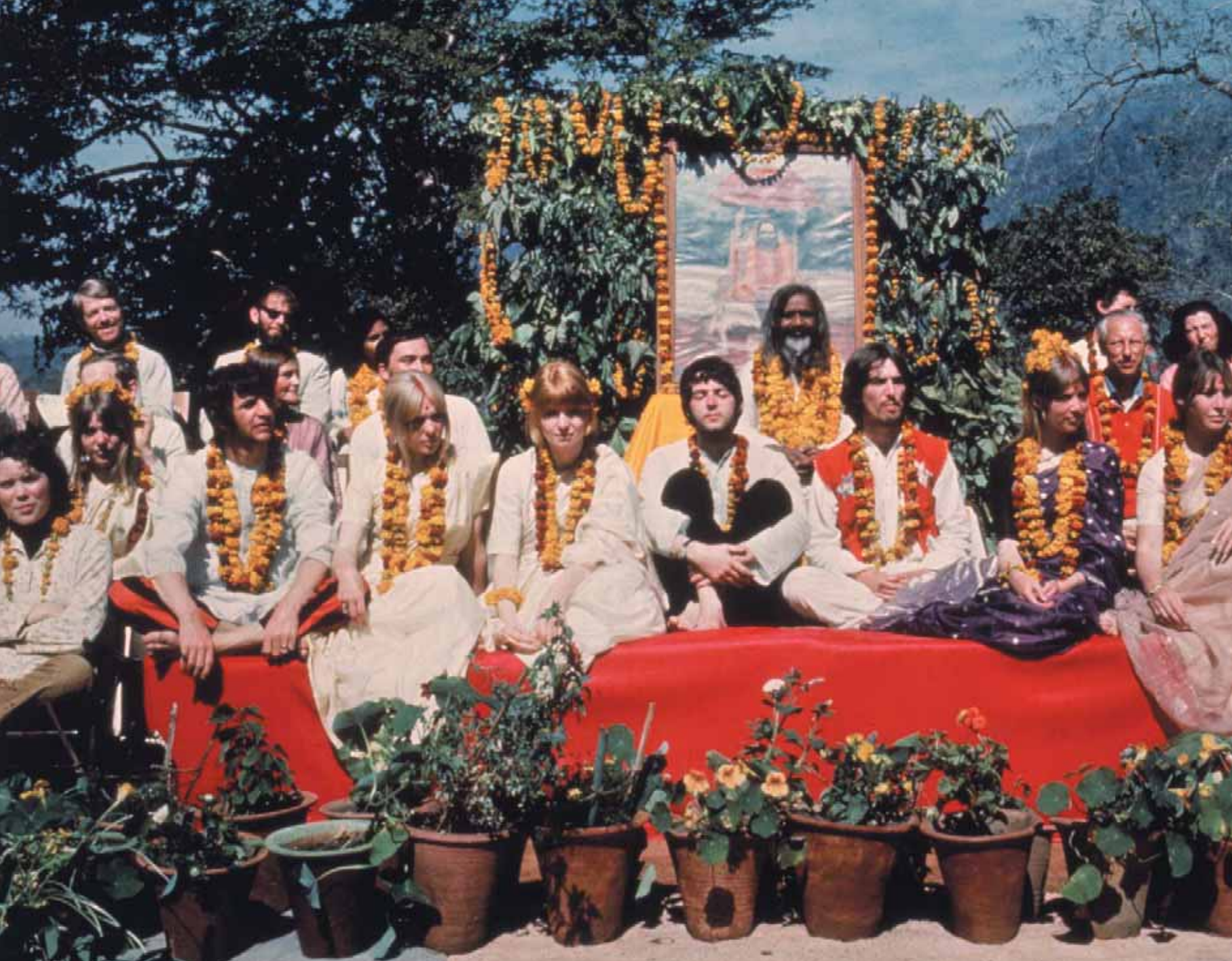
Front row (left to right): Ringo Starr, Maureen Starkey, Jane Asher, Paul McCartney, George Harrison, Patti Boyd, Cynthia & John Lennon – Rishikesh, March 1968