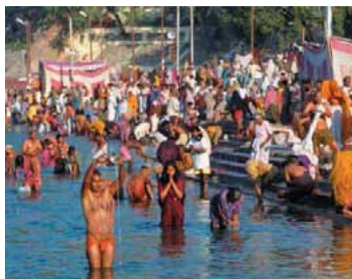
Bathing ghats, Rishikesh