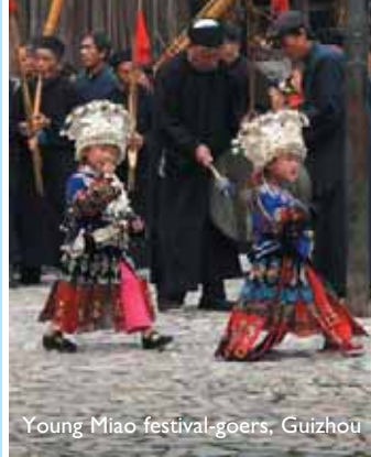
Young Miao festival-goers, Guizhou