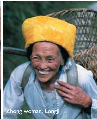
Zhong woman, Longji