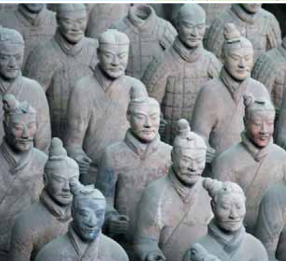
The museum of terracotta warriors and horses, Xian