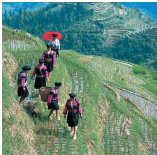
Dragon's Backbone Rice Terraces, Longji