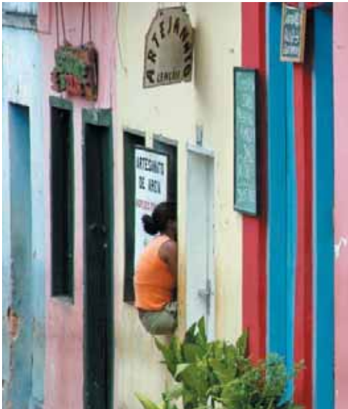
Colourful houses of Lençóis