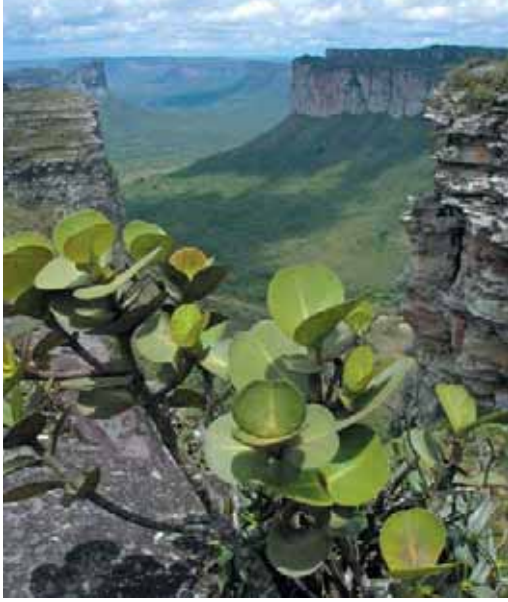
Chapada Diamantina National Park