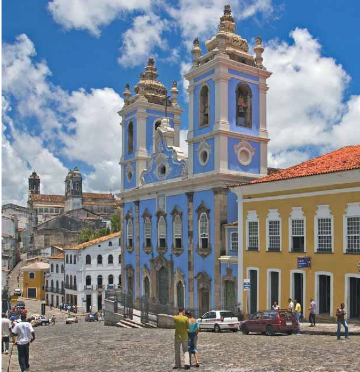
Pelourinho district, Salvador