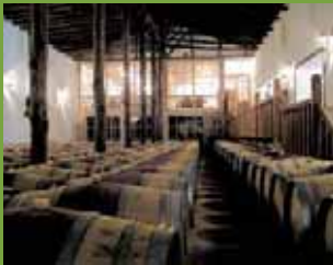
Barrell room and Restaurant at the Casa Silva, Colchagua Valley, Chile

Whether you're a serious wine buff, teetotal, or simply enjoy the odd tippie, winegrowing regions are always fascinating places to visit. Here are our favourite places to immerse yourself in viticulture.