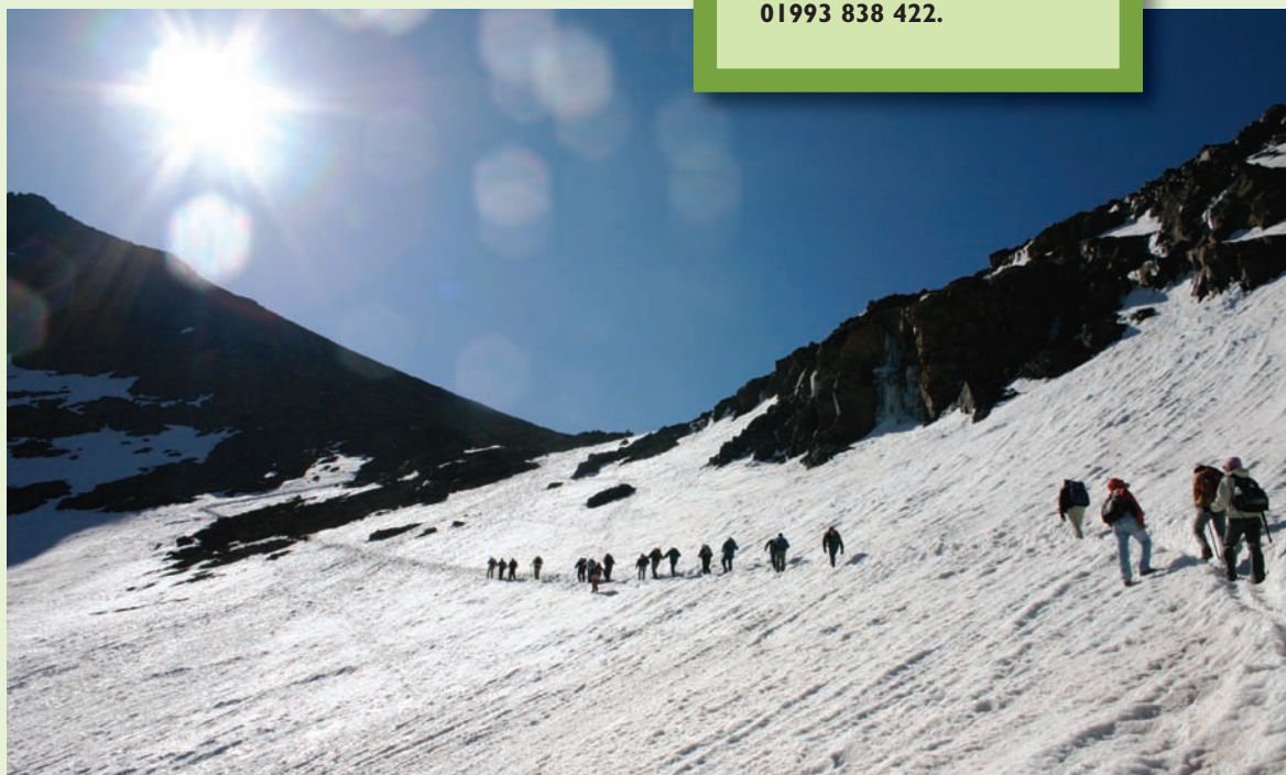
Ascent of Jebel Toubkal