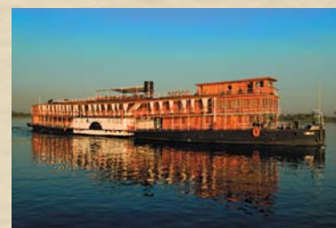
M/S Steam Ship Sudan