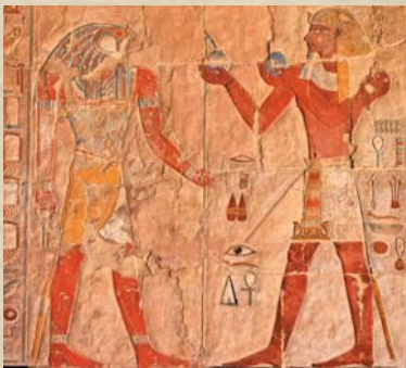
Horus fresco in the Temple of Queen Hatshepsut, Luxor

T HE NILE IS AT THE HEART of all 5,000 years of recorded Egyptian history and is easily the most famous river in the world. What makes it so special for me is the tangible link with history that I feel more strongly here than anywhere else. This is most true of the stretch of Nile between Aswan and Luxor, where pharaohs built their imposing temples and tombs. Although you may travel upon the Nile in a modern cruise boat, or beside it in an air-conditioned minibus, your view from the window has changed so little since Pharaonic times: bullocks still plough lush fields watered by the Nile, fields that once belonged to the temples that lie alongside the river, glimpsed through the fronds of palm trees as you approach.