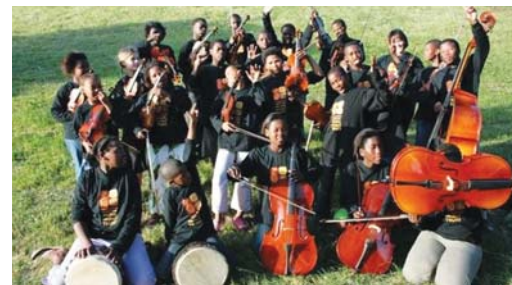
Hout Bay Music Project, teach children from poor communities in Hout Bay to play classical music

South Africa is a country boasting an abundance of attractions, from safaris to wine lands, which have combined to make it a very appealing destination for the visiting traveller. However, away from the usual tourist trail is a country still coming to terms with its recent political past and trying to address a myriad of social, education and health problems. Audley has worked with the Uthando project for just over a year now and here we explore the work of the charity from four different perspectives: the founder, the beneficiary, the visiting client and the staff at Audley.