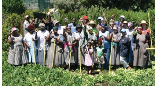
Staff at Abalami Gardens

Our special thanks again for assisting us, without you we would not be operating the centre. We look forward to a very long prosperous future working with Uthando South Africa. ”