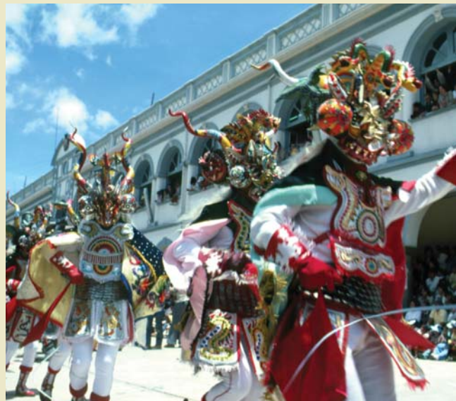
Bolivia Oruro Carnival

Up in the Andean regions you will see llama, alpaca and vicuña grazing at altitudes over 4,000 metres, while the Salar de Uyuni is an important breeding ground for several species of flamingo, including the rare James flamingo. Avid birdwatchers could consider heading further off the beaten track to the eastern regions of Bolivia around Santa Cruz and the Noel Kempff Mercado National Park.