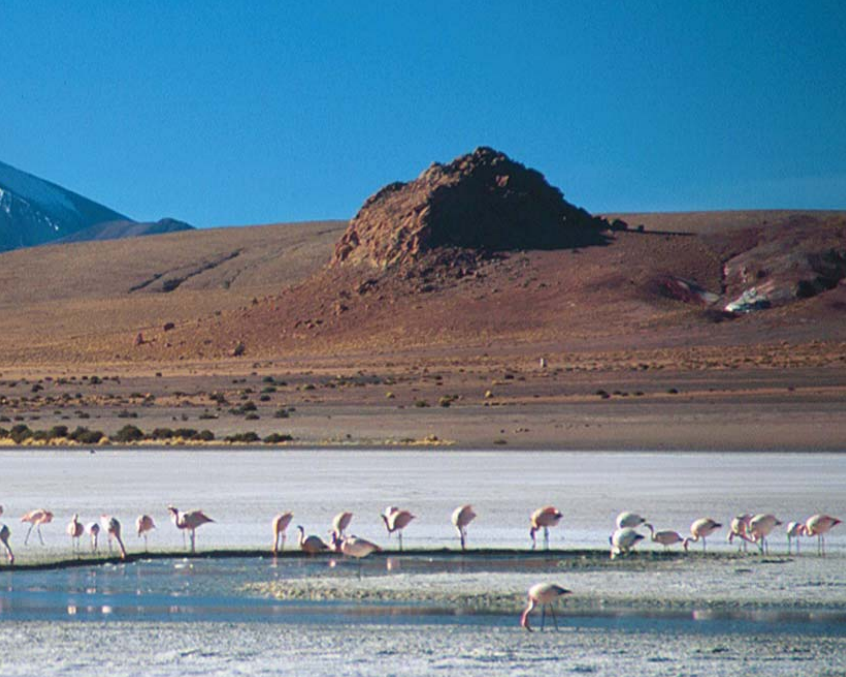
Flamingos, Salar de Uyuni