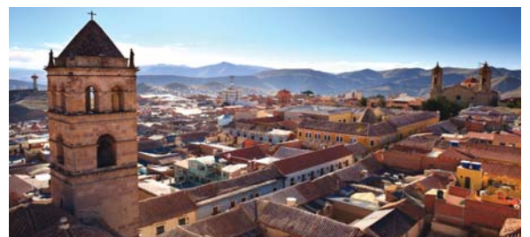
Rooftops of Potosí

Bolivia is almost a microcosm of the whole continent. So why is it off most people's travel radar? We understand that it is isn't for everyone – it is one of the poorest countries in Latin America and the infrastructure is limited – but we know that there are many people out there who would love it, so coming up are just a few of the reasons why we think Bolivia deserves to be considered.