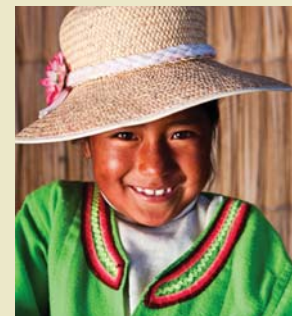
Local girl, Lake Titicaca