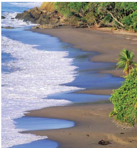
Beach at Manuel Antonio National Park

With over 1,300 kilometres of coastline, Costa Rica has a variety of beaches, from sheltered, golden sands ideal for swimming to more rugged and wild beaches with black volcanic sand and strong surf. As a general rule the Pacific coast is more developed and has a wider range of accommodation options. The Caribbean coast is a more laid-back area, with smaller, more simple hotels and virtually deserted beaches.