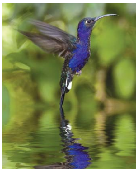
Blue hummingbird, Tortuguero National Park

Thanks to their high altitude Costa Rica's magical cloudforests attract different species of flora and fauna from their low-lying cousins. One of the most memorable is the beautiful resplendent quetzal, a stunning little bird of emerald green and ruby red plumage. The most well-known of the cloudforest reserves is Monteverde, which offers a variety of