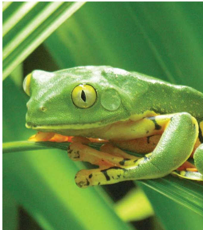
Tiger frog, Tortuguero National Park

Considered Central America's most active volcano and in the top ten most active in the world, the impressive Arenal volcano is not to be missed. The last major explosion was in 1968 and the volcano has been erupting ever since. On a clear day smoke can often be seen billowing from the top and by night lava flows down its sides. Even if bad weather obscures the summit, you will certainly hear the explosions at night. The area around the volcano is rich in wildlife and after exploring on foot, on horseback, or by boat, you can relax in the naturally-heated thermal springs found nearby.