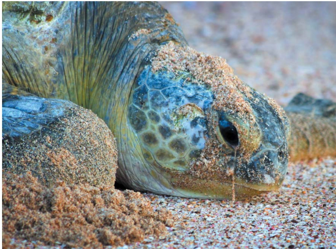
Green turtle, Ras Al-Jinz

The establishment of the Ras Al-Jinz Sea Turtle and Nature Reserve in 1996 was one step along the path to preserving these impressive creatures, although initial conservation efforts were perhaps