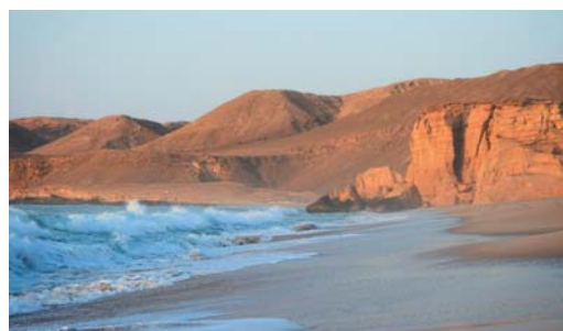
Sunrise on Ras Al-Jinz beach

of the Hajar Mountains. Having done this, it's now time to live out your Lawrence of Arabia fantasies, with a night amidst the vast ochre dunes of the Wahiba Sands. Finally, sandwiched between the desert and the journey back to Muscat, comes your night at the Ras Al-Jinz Scientific and Visitors Centre. Many people choose to round their trip off with some downtime in one of those fantastic Muscat hotels, but for the intrepid, the history and monsoon microclimate of Salalah, or perhaps the fjord-like scenery of the remote Musandam Peninsula beckon, but we'll save those for another day!