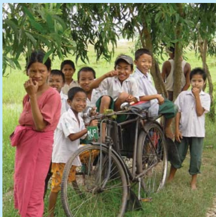
School children, Paya Ngoto