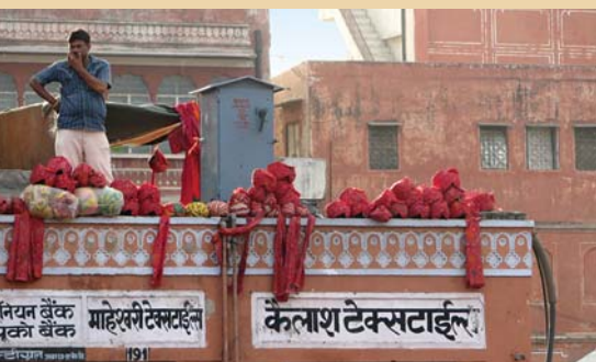
Shop selling turbans, Badi Chaupad market, Jaipur

India boasts some major attractions, all of which we recommend visiting, but sometimes the most memorable experiences can be found by stepping away from the tourist trail and exploring the back streets, particularly if you have one of our excellent guides with you. Here, our India specialists suggest some great examples of places where you can combine visits to the major attractions with some time gaining a better insight into local daily life.