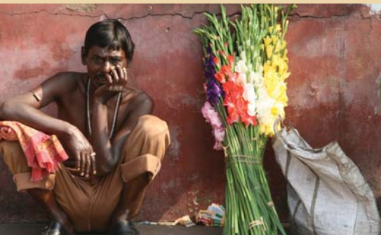
Flower market, Calcutta

exploring India away from the tourist crowds