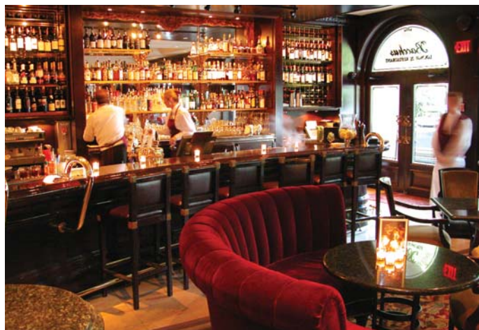
Bacchus restaurant, Wedgewood Hotel