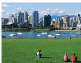
View to Yaletown from False Creek