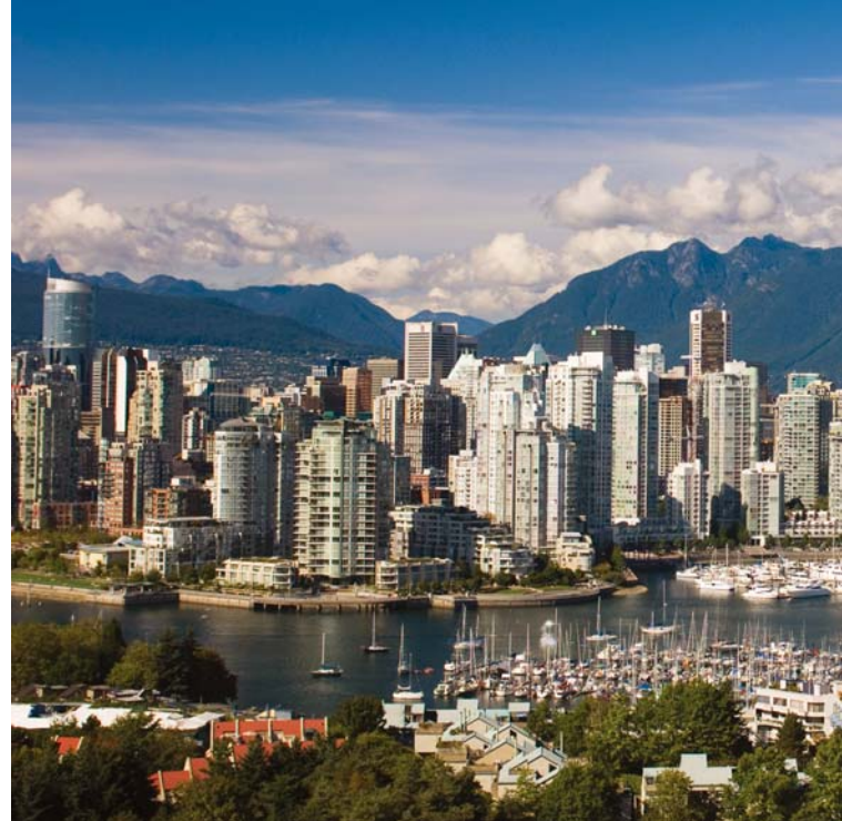
Aerial view of Vancouver

JUST ONE VISIT and you'll understand why Vancouver is regularly voted one of the best places in the world to live. Offering the cosmopolitan vibe of a major city, yet compact and simple to navigate, Vancouver also sits in a spectacular natural setting. Snow-capped peaks, pretty beaches and lush rainforest are within easy reach of the historic streets of Gastown, the exotic sights and smells of Chinatown and the laid-back delights of boho Granville Island. Whether you want to learn about First Nations culture and history, go whale watching or sea-kayaking, sit on the beach or simply enjoy some top-class dining, shopping and entertainment, multi-cultural Vancouver has it all.