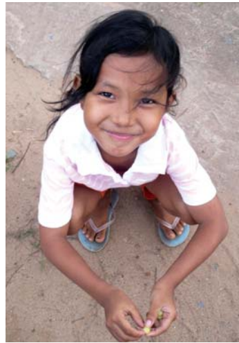
A local girl in Kampot