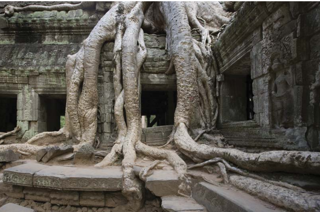
Ta Prohm Temple