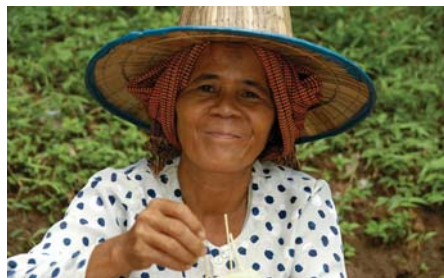
A friendly lady at Angkor

Taking an elephant ride through the beautiful forested landscapes of Mondulkiri was a highlight for me as was kayaking through the deserted mangroves on the edge of the Cardamoms. However, my favourite place was the sleepy, coastal town of Kep. Being a keen photographer, I loved the atmospheric, abandoned mansions which dot the town. An early start saw the fishermen still hauling in their daily catch for sale at the local crab market, which later offered some of the best seafood I have ever eaten.