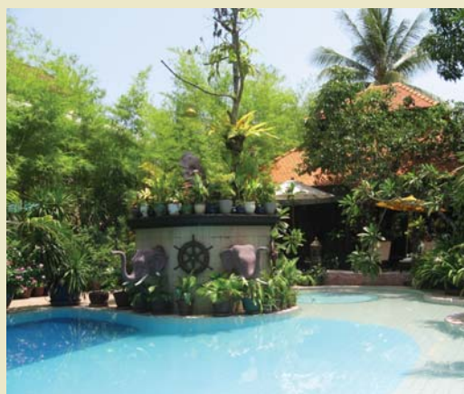
Hanuman Alaya in Siem Reap

Unique floating tents on a bend of the Tatai River