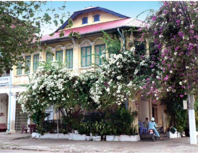
Colonial buildings in Kampot