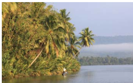
The Cardamom Mountains, Cambodia

Once known as the "Pearl of Asia", Phnom Penh (3) has a tragic past but a promising future.