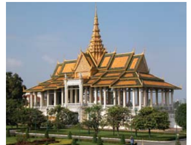
Chan Chaya Pavilion in the grounds of the Royal Palace, Phnom Penh

Tabitha Foundation: Their Buy a Well Project aims to improve the quality of life for local families by providing a clean water source. You can spend a morning or afternoon visiting a village near Phnom Penh to learn about the difference a well can make and then return to the city to visit the Tabitha shop with its exceptional collection of hand-woven silk products.