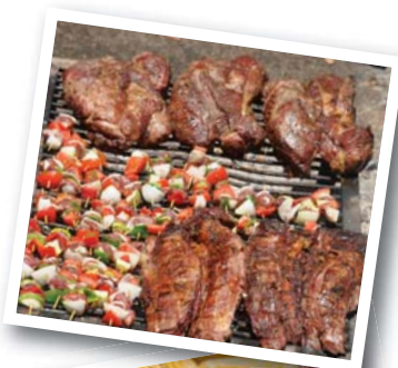
Top: Typical lunch in Brazil