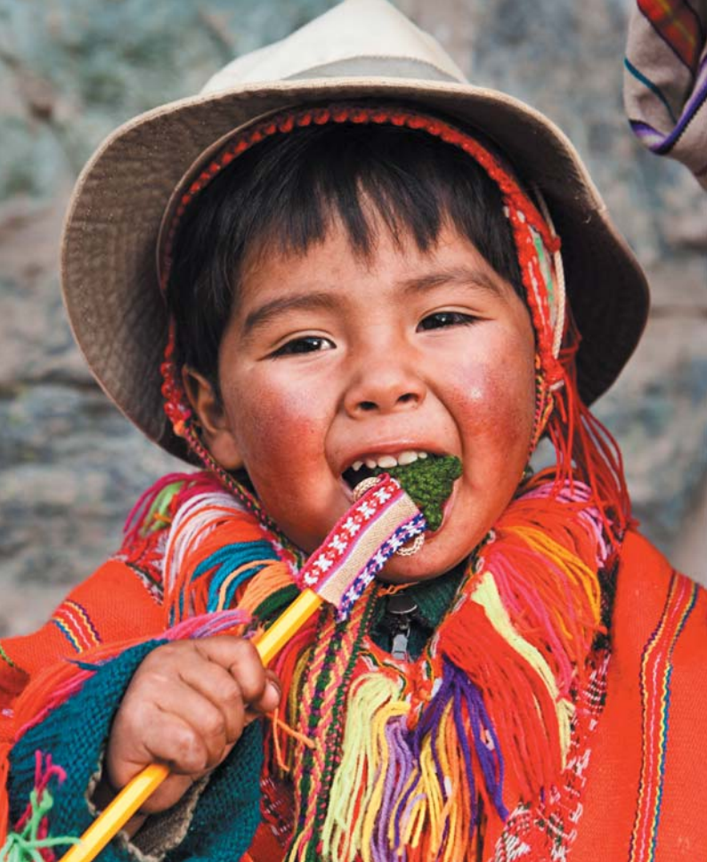
Young boy in the Sacred Valley, Peru