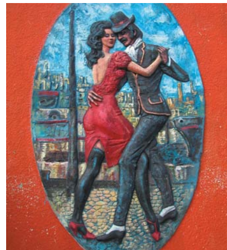
Tango is essential to life in Buenos Aires

Our prices start from £1,850 for a 10 day trip to Brazil and Argentina, putting it broadly in line with trips to other parts of the world that we operate.