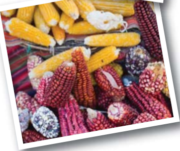
Bottom: Corn, a staple ingredient for many South American dishes