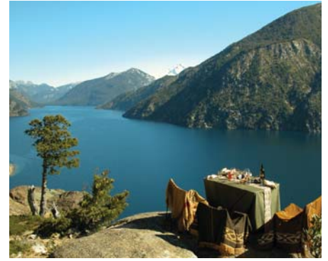
Dining with a view, Argentina

South America isn't renowned for its cuisine in the same way as for example, Vietnam, Thailand or Morocco are, but we think it has some of the best flavours and foods we have ever tasted – at least for carnivores. Argentina is justifiably famous for its steaks, Brazil offers a diverse array of regional flavours, and both countries are renowned for their own adaptations of the barbecue. Peru has jumped on the idea of fusion food by taking international dishes and adding an Andean twist, and no trip to Chile would be complete without sampling Patagonian lamb. To accompany the food, Chilean and Argentinian wines are undoubtedly some of the best in the world and Brazilian caipirinhas (a cocktail of rum, lime, sugar and ice) are fabulously potent.