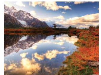
El Chaltén, Patagonia

Trips to Chile and Argentina start from £2,295 per person.