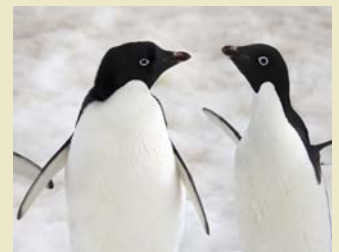
Adélie penguins, Antarctica

Trips to Bolivia start from £2,350 per person.