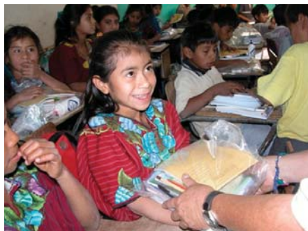
Amigos de Santa Cruz, Guatemala

The support and funding from Audley goes a long way to helping these extremely worthwhile charities. Please ask us for further information if you would like to contribute or visit the projects while you are in South or Central America.