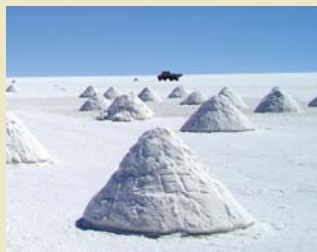
Salar de Uyuni, Bolivia

Trips to Argentina start from £1,650 per person.