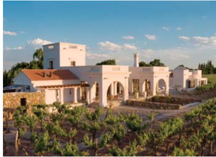
The luxurious Cavas Wine Lodge, Argentina

You can also find plenty of inspiration and practical information on our website.