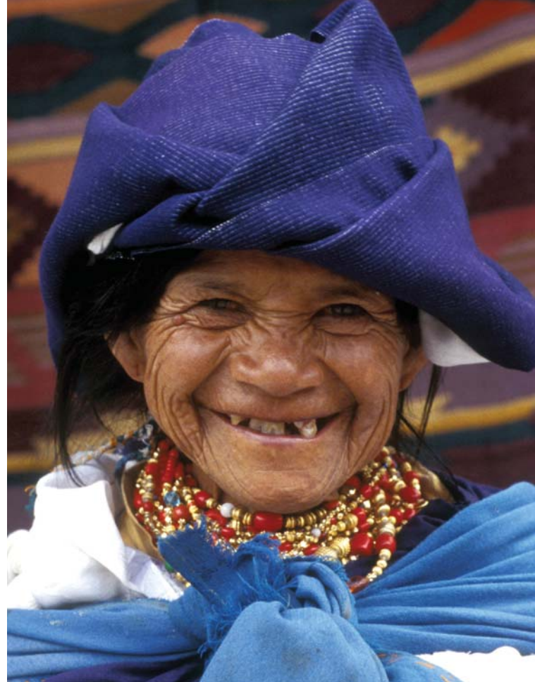
Otavalan woman, Ecuador