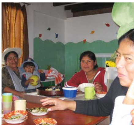
Amigos de Santa Cruz, Guatemala