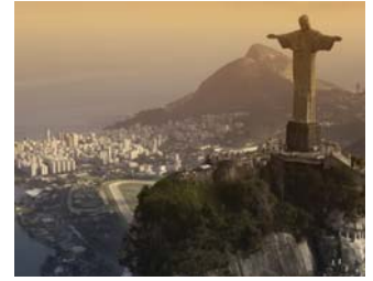
Rio de Janeiro, Brazil

Trips to Peru start from £1,950 per person.