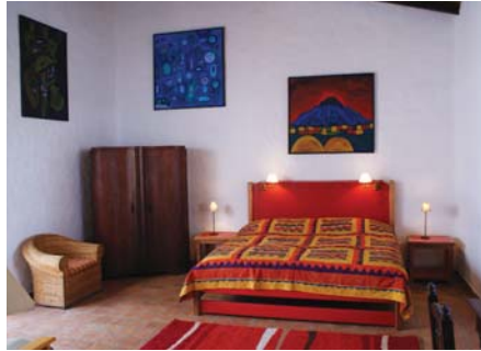
Room at the simple but delightful Hosteria Pantavi in Ecuador