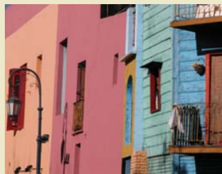
La Boca, Buenos Aires

Trips to the Amazon start from £2,500 per person.