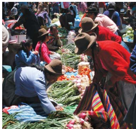
Chincheru market in the Sacred Valley, Peru

Your Audley 'Travel Organiser' that contains your itinerary and other important information will include up-to-date restaurant recommendations, many passed on to us by returning clients. Special mention must go here to La Ciccolina in Cuzco, highlighted as a favourite (without any prompting by us!) of practically every single client visiting Peru.