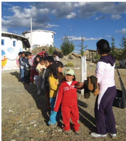
Suma Kamaña, Bolivia