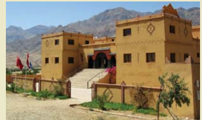
Kasbah Chez Amaliya, Tafraoute

Superbly positioned on the outskirts of the village of Imouzzers des Ida Outane, the hotel is surrounded by the mountains at the western tip of the High Atlas. Our balcony gave us a stunning view down a valley, and the sunsets were mesmerising. Although I had little idea where I was on a map I didn't really care.