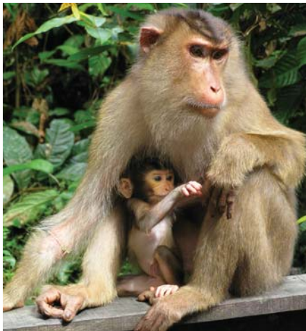
Female macaque and infant at Sepilok Orang-utan Sanctuary

WE'RE ALWAYS INTERESTED to hear about your travels, whether it's a return trip to a country you love, great moments captured on camera, or the smaller things that help make an enjoyable trip such as a great restaurant, good book or a piece of travel advice.