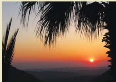
Sunset from our balcony

Sitting on the terrace of our hotel in mid-May, looking down over lush gardens and a very inviting swimming pool, all our apprehensions disappeared. The scent of roses, geraniums, hollyhocks and Arun lilies wafted through the air and the sound of trickling water rose from the many pools and waterfalls of the aptly-named Hotel des Cascades.