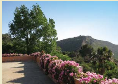
The air was filled with the scent of flowers

Suffering from a bout of post-holiday blues on a cold winter's evening, our conversation meandered around to possible destinations for a short-flight holiday in the spring. We discussed various options and discounted most of them, but Morocco just kept on cropping up. We'd already been on six previous occasions and wondered if another visit could possibly live up to the memories of the stunning scenery, vibrant colours and incredible architecture we had encountered. We didn't want to come home disappointed and needed a route that would include both the country's frenetic city souks and languid remote villages.