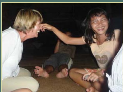
A forfeit during one of the games

Kay Rawlins travelled to Borneo with Audley in September 2010.