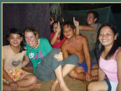
Staying with the Iban tribe was the highlight of our trip