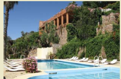
The swimming pool at Hotel des Cascades

The following day we explored the area driving through palm-lined valleys and past isolated villages. Everywhere, as for most of our holiday, there was dawn 'til dusk activity in the fields as the harvest was being gathered, mostly by hand.